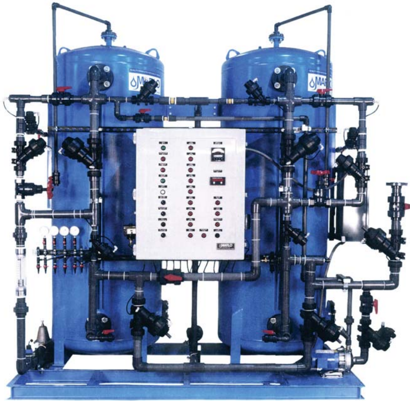
(Single System With Optional Recirculation Pump)