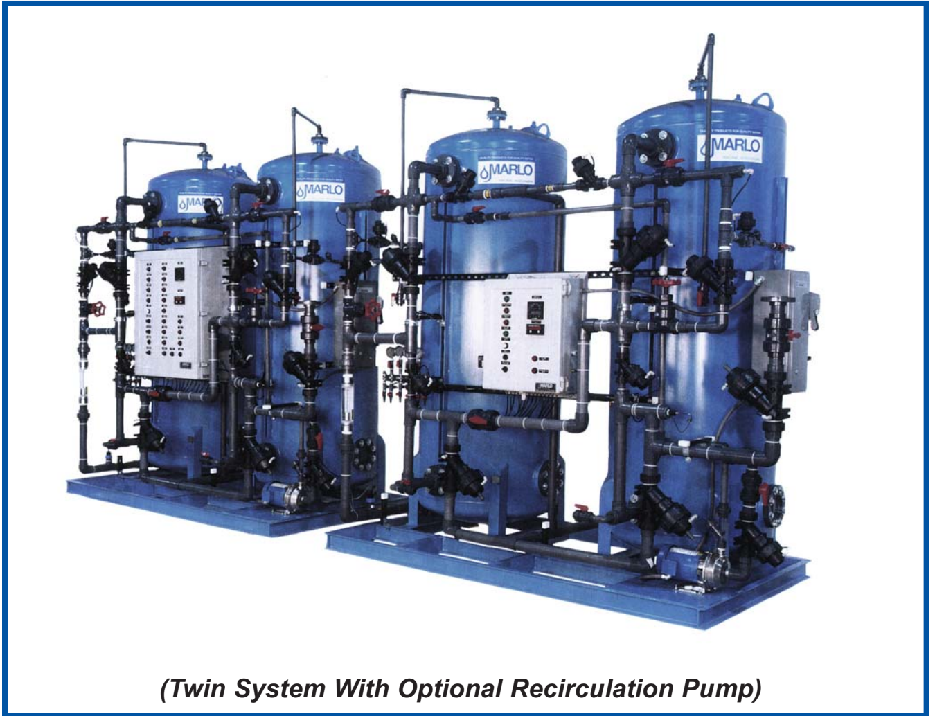
(Twin System With Optional Recirculation Pump)