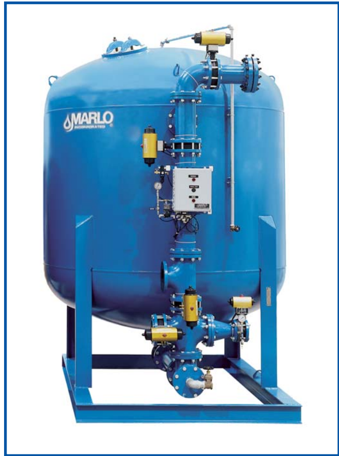
MARLO FILTER SHOWN WITH BUTTERFLY VALVES