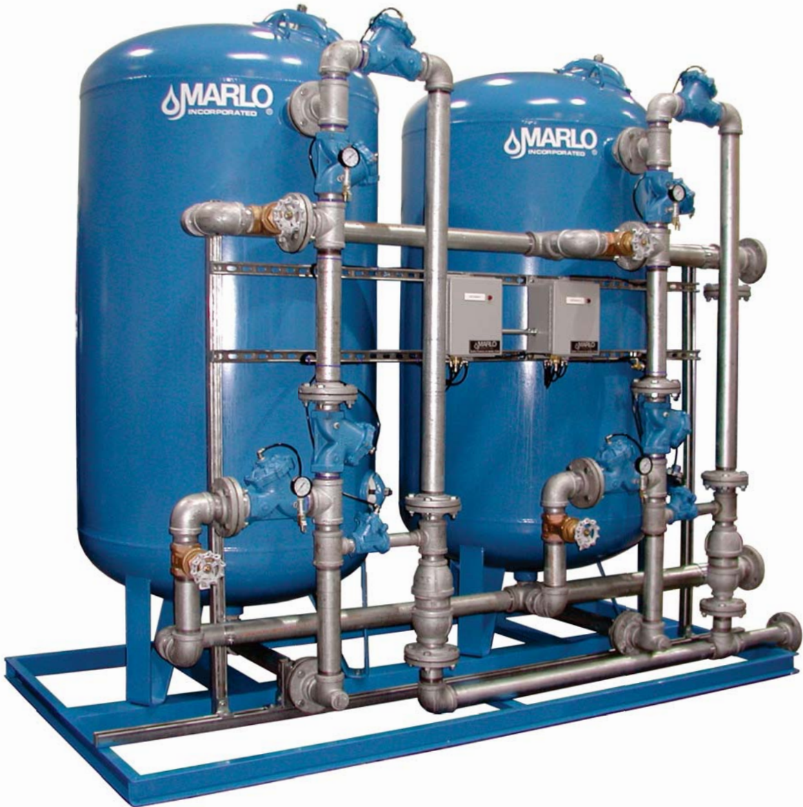
Dual MFS Filter System With Skid Mount, Prepiped and Prewired Option