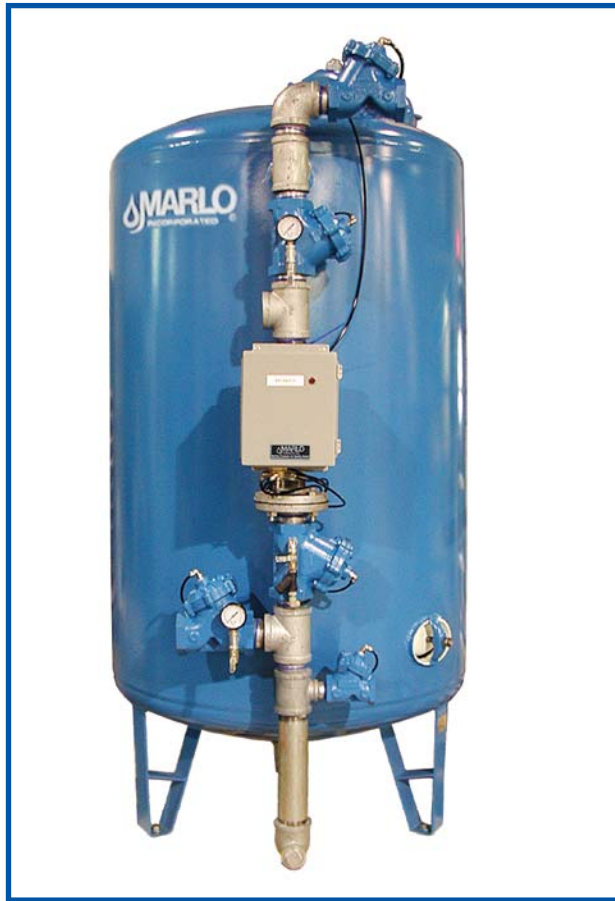
MARLO FILTER SHOWN WITH DIAPHRAGM VALVES